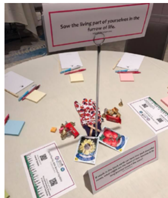
The tables were set for cultivating, nurturing, and harvesting success!