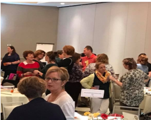
SIM Block Party Session