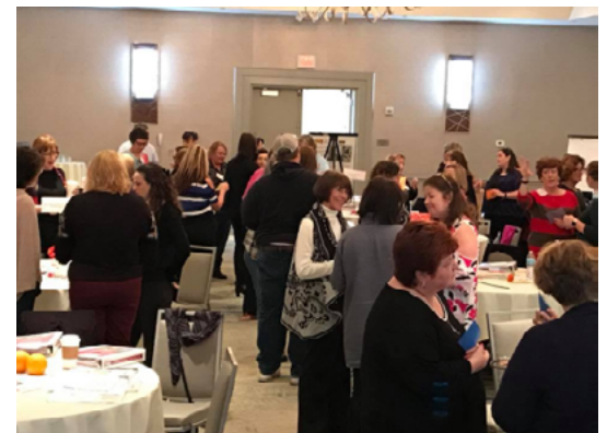
SIM Block Party Session