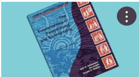
Fundamentals of Paraphrasing and...

We now have three self-paced online professional development courses on Canvas thanks to the work of some dedicated SIM Professional Developers and our own Mona Tipton. These courses allow teachers to learn more about SIM on their own schedule with the opportunity for follow-up coaching. Each course walks participants through the professional development in easy to tackle lessons, includes supporting materials for teachers, and participants have the ability to earn a professional learning micro-credential at the end of the course. As an active SIM Professional Developer, you can contact simpd@ku.edu to join as a student for free to check the courses out. Thanks so much to everyone for helping to get SIM PD online!